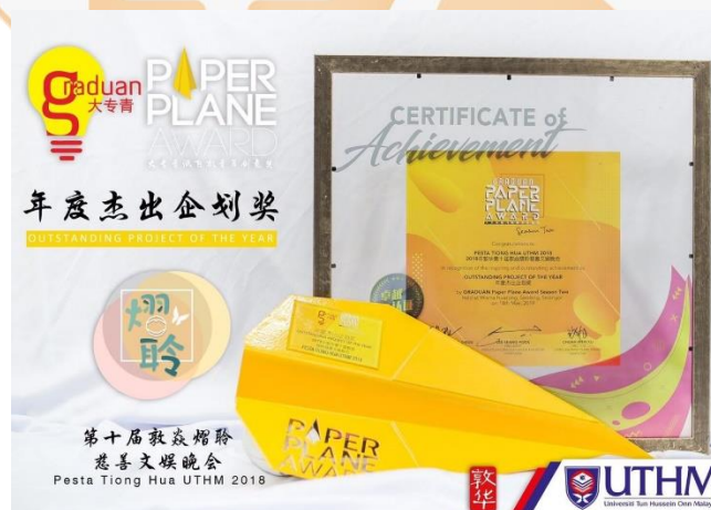
Pesta Tiong Hua UTHM 2018 successfully received an Outstanding Project of the year in GRADUAN Paper Plane Award.