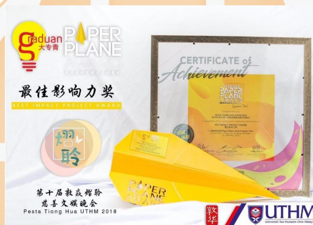
Pesta Tiong Hua UTHM 2018 successfully received a Best Impact Project Award in GRADUAN Paper Plane Award

GRADUAN Paper Plane Award is an award ceremony organized by GRADUAN. The organizer will appoint outstanding entrepreneurs from all industries as well as media to be the professional judges of this competition, accessing the performance of participating organizations and projects from the perspective of experts. Through these awards, the efforts of the committee members of Pesta Tiong Hua UTHM 2018 are recognized. Pesta Tiong Hua UTHM 2018 which organized by Tiong Hua Cultural Bureau, Secretariat of Unity UTHM had successfully received two rewards during the GRADUAN Paper Plane Award- Season Two.